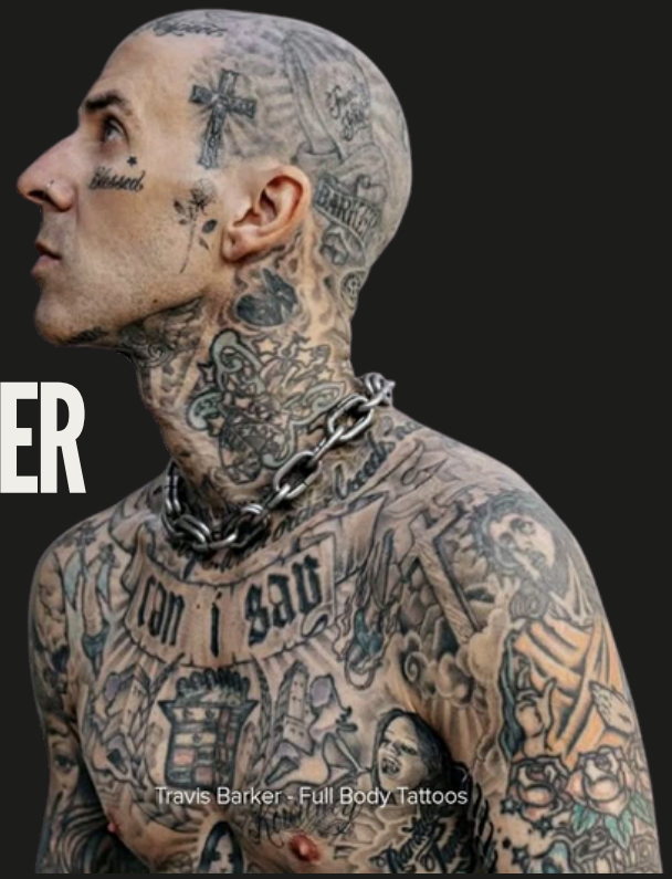
Travis Barker - Full Body Tattoos