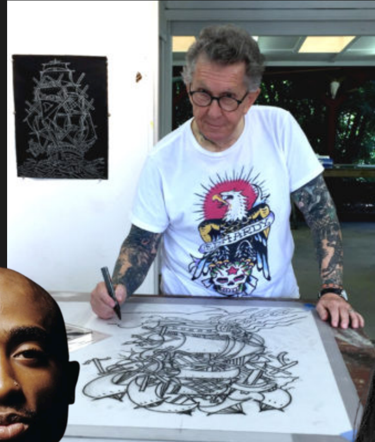
ED HARDY - TATTOO ARTIST